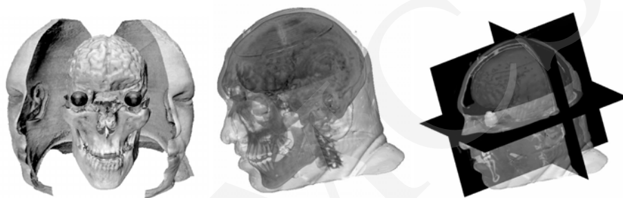
Fig. 3. Three-dimensional visualization techniques: (from left) surface rendering, combination of volume and surface rendering, 3D-slices combined with surface rendering

been performed on a PC system (Athlon XP 3200+ 2.2 GHz, 512 MB RAM). The matching process of the MRI and RGB datasets using the mutual information measure and the Powell's optimization method took 20 minutes 41 seconds (two-step rigid and affine multi-resolution approach) and required 2531 evaluations of the mutual information objective function. In the second case (CT and RGB datasets) the total running time took 4 hours 50 minutes 4 seconds (two step multi-resolution approach) and the mutual information function has been evaluated 1735 times.