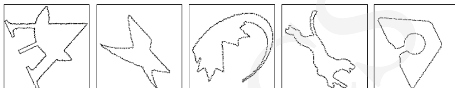
Fig. 3. Some exemplary rotated test objects in the second experiment

In the second experiment 50 trademarks rotated by a random angle were tested. Additionally, noise influenced a silhouette. This time, two objects were not recognized properly. A few examples of tested objects are provided in Figure 3.