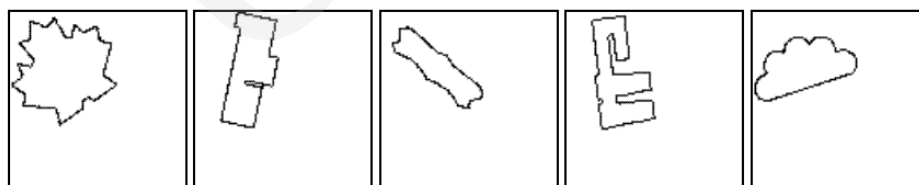
Fig. 4. Some exemplary test objects in the experiment exploring the influence of scaling

The last experiment explored the influence of scaling on the recognition results. This time, two separate values of deformation were utilized. At first the test objects were twice diminished, then twice enlarged. That gave 100 instances of test objects. A few of them are presented in Fig. 4. This time the recognition rate was equal to 91%. As it turned out, the reduction in size was much more difficult to handle (8 incorrect matches) than enlargement (only 1). It can be explained by small sizes of the resulting objects. Part of an image with the test trademark was only 50 by 50 pixels in size. Therefore, the results can be nevertheless assumed as satisfactory.