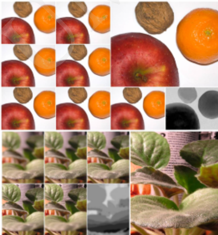
Fig. 3. Multifocus Image Fusion example sets. Small images are part of the original multifocus image set; last small, blurred image is the Height Map; large image is the fused image