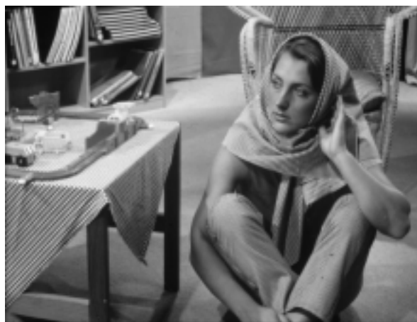
Fig. 1. Test image (“Barbara”) used in experiments

In the further parts of the paper we show the main principles of 2DKLT together with the three application areas: image compression, image scrambling and information embedding. All the experiments have been performed on the standard benchmark images. The image “Barbara” (8-bit gray-scale, 640×480 pixels) shown in Fig. 1 is employed in all cases as an example, since it contains areas of different nature (i.e. smooth, detailed, edges, etc.) and a human face, on which any unusual artifacts can be perfectly observed.