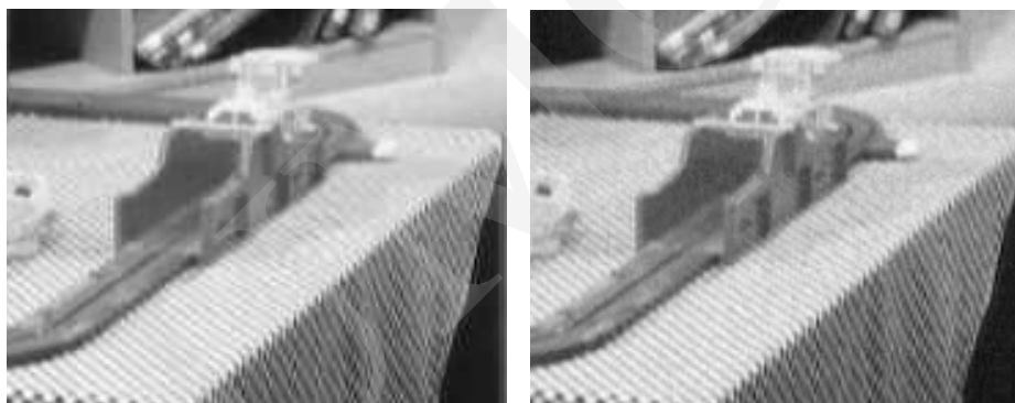
Fig. 3. Enlarged fragment of the test image compressed using the DCT-based (JPEG/JFIF) and 2DKLT-based algorithms

Figure 3 shows a comparison of the two compression methods: DCT-based (on the left) and 2DKLT-based (on the right). Enlarged fragment of the test image shows that the 2DKLT-based compression gives much more details reducing blurring of individual blocks. It is a result of optimal adaptation of basis functions for this specific image.