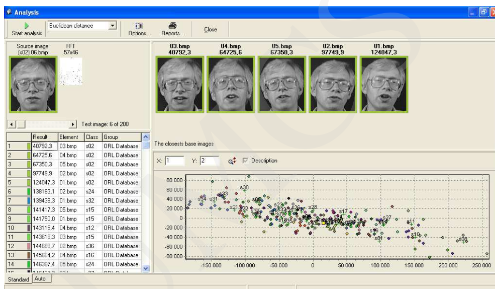
Fig. 3. Sample results of recognition in the FaReS environment (overall recognition rate equal to 95%)

The classification employs feature space created for all face images in the database. A query face is projected into it and Euclidean distance is being calculated. Two alternative distances are taken into consideration: the first one is a distance to all elements, whereas the second one is the distance to the centers of all classes only ( \bar{X}^{(k)} ). The latter approach is easier to perform and requires much fewer computations, however, its efficiency is lower in the case of irregular clusters. One of the recognition experiments is presented in Fig. 3. It was performed in "FaReS-Modeller" Environment [9]. As it can be seen from the figure below, it gives 5 nearest images from the database for a query image ("source image" in the picture), sorted in the decreasing similarity order.