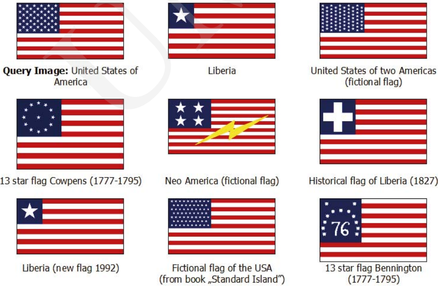
Fig. 3. Sample retrieval results. The most up-right image is a query object.