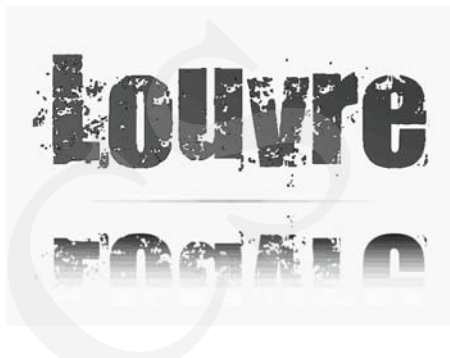
Fig. 1. The project logo as an exhibit.

The rest of the paper is organized to describe the LOUVRE project from different points of view: the following section contains technical information about the programming library, including hardware and software requirements. Section 3 describes how LOUVRE-based applications can be interacted with – the end user point of view. Section 4 contains basic information on how to use LOUVRE for scientific visualization and how to add new types of objects. Section 5 discusses the relation of LOUVRE to other similar tools. The paper is concluded by a discussion of the strengths and weaknesses of this form of visualization, as well as possible applications and future development.