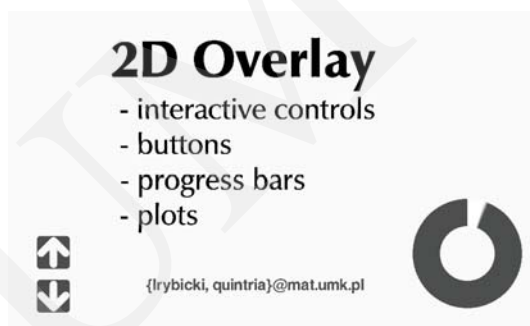
Fig. 4. Presentation of the 2D Overlay: two buttons, a static label and a circular progress gauge to-gether with a slide exhibit.

up.onClick = &display.camera.forward; down.onClick = &display.camera.back;