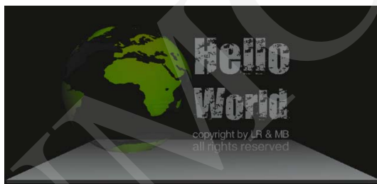
Fig. 5. A complex exhibit with an animated rotating object and a column of text labels.

The above line creates a Slide exhibit, which will contain a title and a bullet list in a column. The Slide constructor creates Label objects out of the string constants and determines their size. The title will be automatically resized to take up the whole exhibit width and the bullets in the list will be resized to have the same font size.