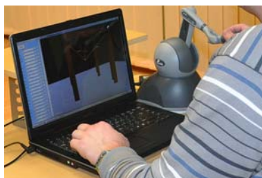
Fig. 5. The photo of the computer screen with the application dedicated to control the manipulator platform.

In the other screen window or on the second computer screen the camera image is displayed. The use of the second screen is not a problem since in practice, today each notebook is equipped with video output for an external computer monitor and a computer operating system is ready to use it.