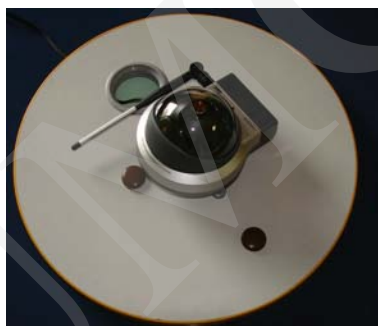
Fig. 4. The photo of the assembling board with the IP camera.

The cable driven platform has the form of the circumscribed circle about the equilateral triangle. The platform is adapted for installation of different work equipment.