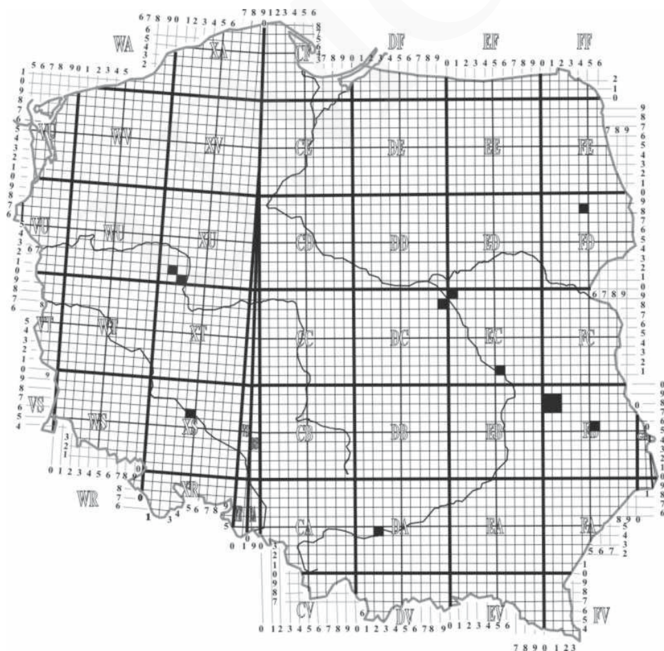
Fig. 4. Distribution of Uloborus plumipes in Poland.

First time recorded from Poland in 2001 from Białystok (101). Since 2002, this species was collected and observed in a number of localities in Lublin, and in several other Polish cities (87). Bigger populations which occur in large garden centers in Lublin may be described as semiautochthonic. They are formed by individuals reproducing partially in place, but these populations are still supplied with a number of specimens coming from almost every transportation of ornamental