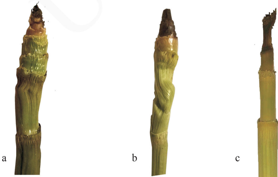
Phot. 2. Basal part of galls with leaves removed: apically widened gall of L. pullitarsis – a, rod-shaped gall of L. pullitarsis – b; gall of L. similis – c