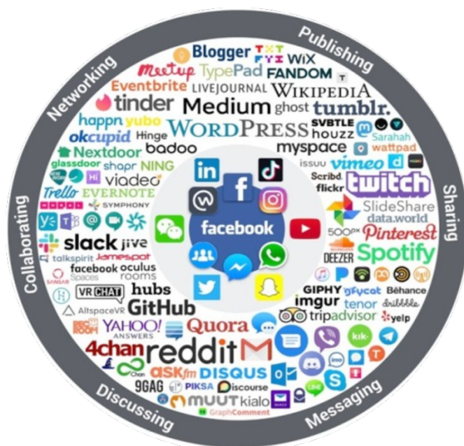
Figure 1. The social media landscape in 2020

Social media offers many opportunities to engage in dialogue with customers, as shown in Figure 1. Every year there are more and more such methods, however, it should be remembered that some of the presented ones are not yet available in different countries. Interestingly, Facebook and Twitter are the leaders in social media. A large number of Facebook users use it on average more than 30 minutes a day, and there are also other platforms such as Twitter, Instagram, Kik or Snapchat.