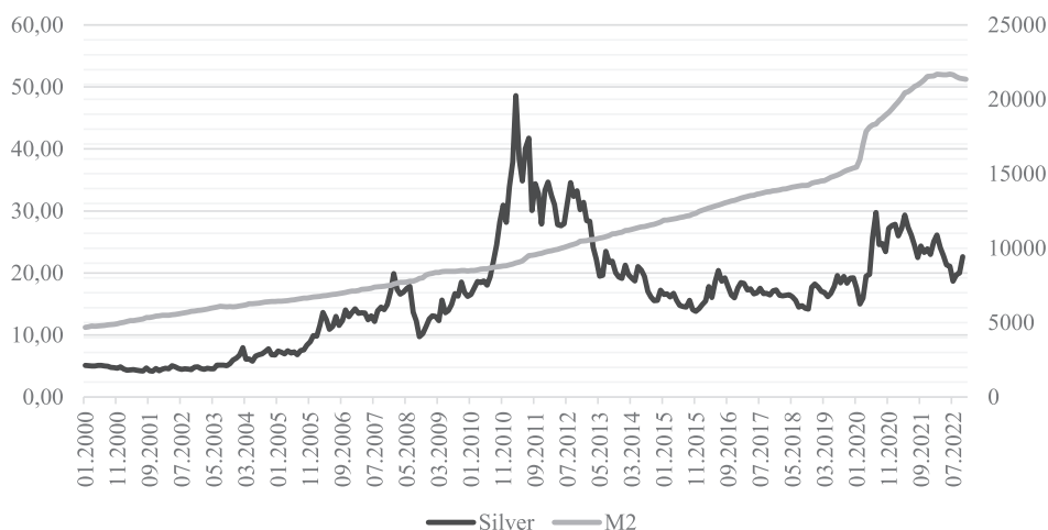
Figure 2. Silver price and USD supply measured by M2

In the case of silver market analysis, another indicator that may be important in determining the impact of external and non-market factors on its price is the money supply as measured by aggregate M2 (cash in circulation and deposits) in the United States (Figure 2).