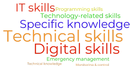
(b) functional competencies