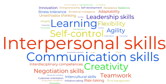
(c) social competencies