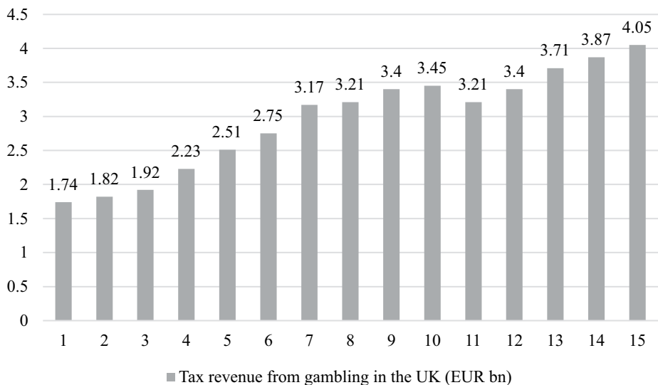
Figure 4. UK's tax revenue from gambling 2010–2024