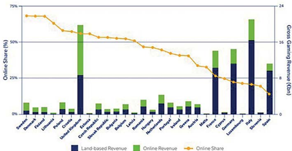
Figure 1. GGR levels of EU member states and the UK in 2023

Gambling markets can vary depending on the degree of regulation in a country, economic conditions and social attitudes. One measure of the size of the gambling market is Gross Gaming Revenue (GGR). In other words, it is the sum of stakes paid less winnings paid out. In many European countries GGR is used as the basis for taxing gambling activities.