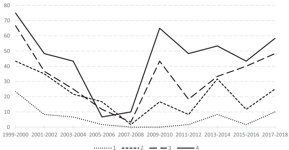
Figure 2. The average percentage of cases in which the returns were normally distributed, taking into account all tests performed and all indexes presented for each two-year sub-period and each returns' interval