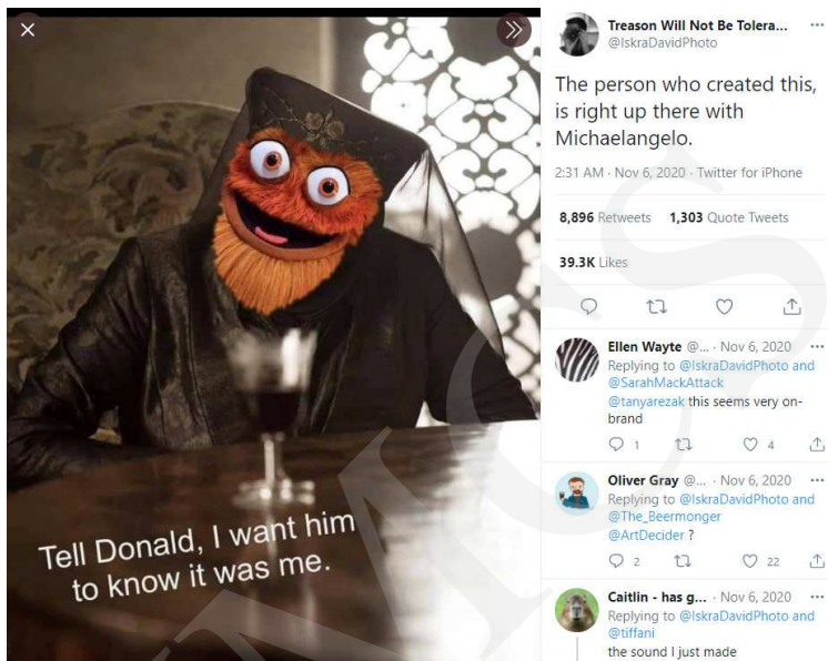
Fig. 3: Example of Gritty meme with high intertextuality by @IskraDavidPhoto (2020)

While the framing is similar to the previously discussed examples, in memes such as this 3 , several elements come together to create the multi-layered joke of the meme: Gritty's head is super-imposed on Olenna Tyrell, a character from HBO's Game of Thrones series. The show's quote is slightly altered to refer to Donald Trump, once again taking the place of a hated villain, this time Game of Thrones ' king Joffrey. Denisova (32) points out that "memes are coded messages and therefore can be confusing for various people: members of the audience may have varying abilities and skills to read the 'code'" in such cases. Here it is both necessary to know the context of the quotes – Olenna admitting to the murder of a tyrant king – and the event it references, with the implied metaphorical murder being Trump's loss of the election, which was attributed to the votes of leftist Philadelphians, as Pennsylvania flipping blue was seen as the key event cementing Biden's victory, metonymically referenced through Gritty.