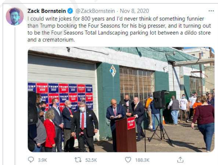
Fig. 4: A photograph of Trump’s press conference, commented on by @ZackBornstein

Another way Trump’s loss of the election was celebrated in meme-format occurred in the form of event references, such as the slow vote counting in Nevada (e.g. Haylock 2020) or in response to Trump’s final press conference. After it was announced that he would be giving a press conference not in the Four Seasons hotel but Four Seasons Total Landscaping parking lot, many memes were created that alluded to this event.