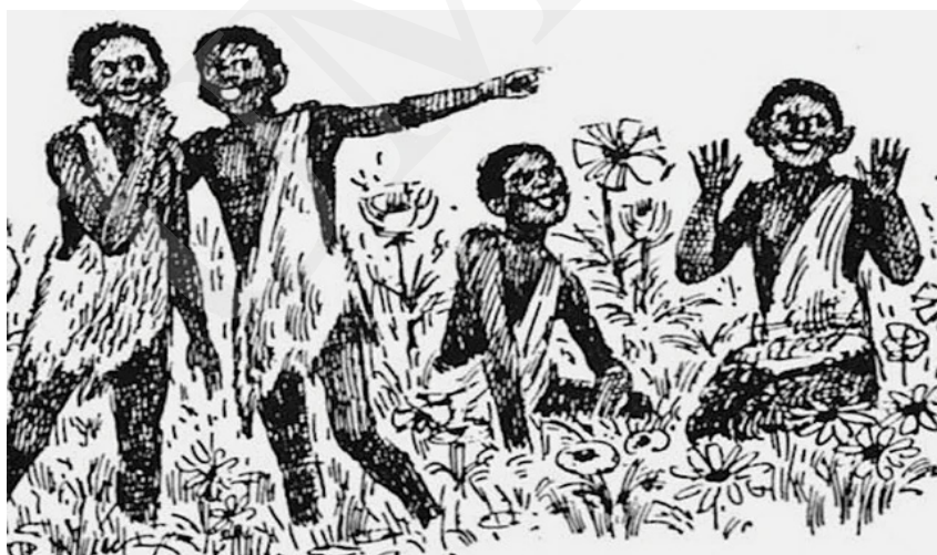
Picture 1. Black Oompa-Loompas illustrated by Faith Jaques in 1977 (copied from Treglown 1994).

The picture below presents illustrations in the first British edition in 1977, made by Faith Jaques.