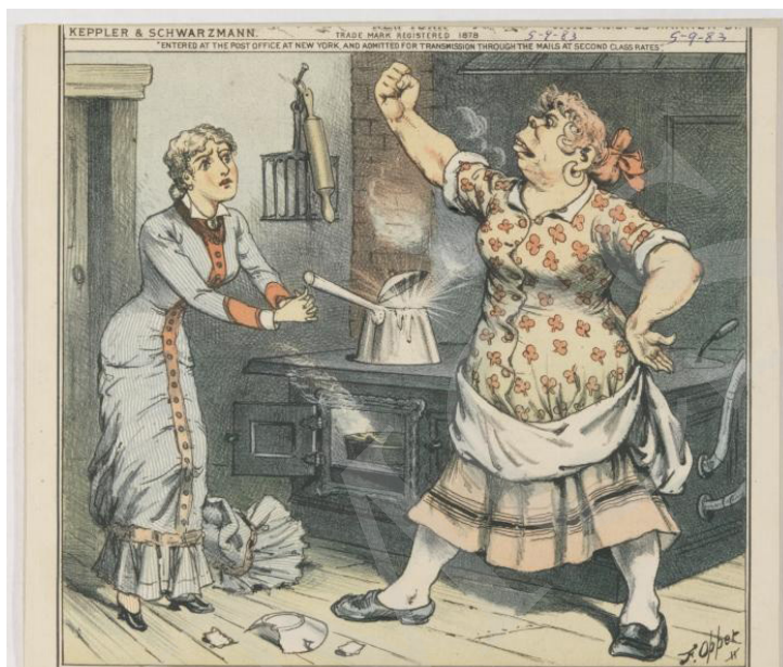
Figure 7. An overbearing Irish maid ( Puck , 1883)