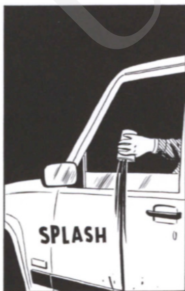
Fig 10. Tomine, A. (2012). Shortcomings . London: Faber and Faber, p. 37.