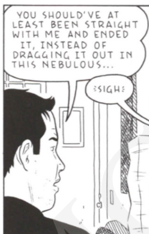
Fig 3. Tomine, A. (2012). Shortcomings . London: Faber and Faber, p. 100.

Motion lines are scarce and subtle and appear usually when Ben slams the phone or throws something on the ground: