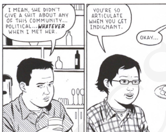
Fig 24. Tomine, A. (2012). Shortcomings . London: Faber and Faber, p. 14.

‘Whatever’ translates into Polish as “cokolwiek.” It cannot be used in this context in Polish as the phrase “polityczne cokolwiek” ( political whatever ) is not something a Pole would say. The use of the word ‘whatever,’ when a speaker is not able or cannot be bothered to find an appropriate, meaningful way to express themselves, functions in English, but in Polish it would not seem natural. Murawska chose the expression ‘hocki klocki’; the word ‘hocki’ is an old Polish onomatopoeic expression which signifies ‘jumping’; ‘klocki’ means ‘blocks,’ as in ‘the LEGO blocks.’ Together, these two words rhyme, and stand for meaningless, silly matters, unworthy of any attention. It is not a literary expression; in fact, it sounds a bit awkward and obsolete. For these reasons, it fits perfectly in Ben’s complaining about Miko’s interest in politics: